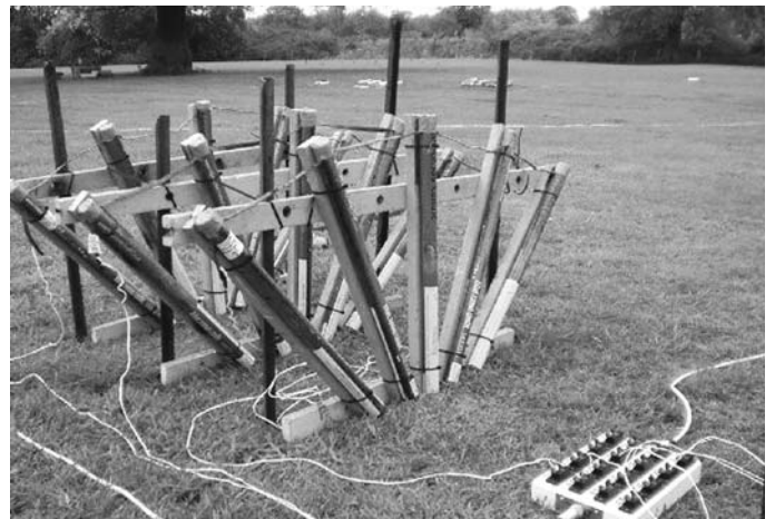
Electrical firing systems for fireworks displays